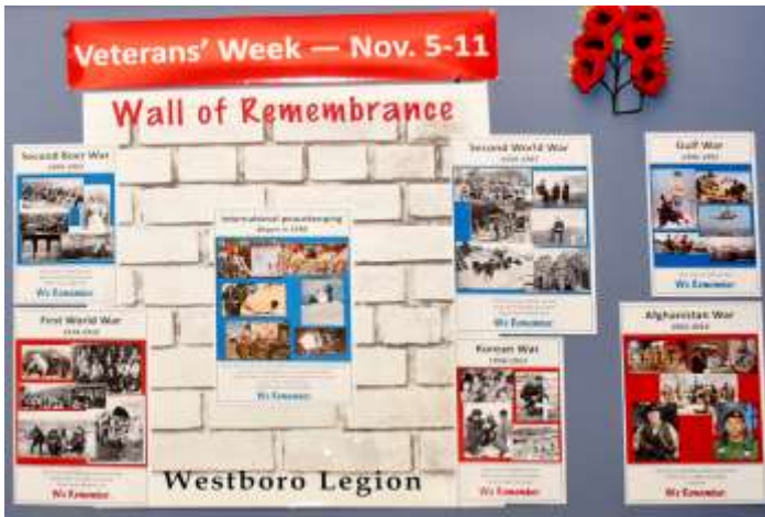
Our Remembrance display at the head of the stairs